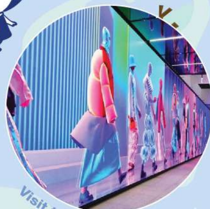
Visit to Hibr Ground