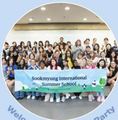
Welcome & Farewell Party