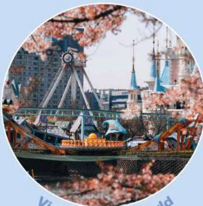
Visit to Lotte World