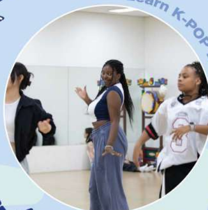
Learn K-POP Dance