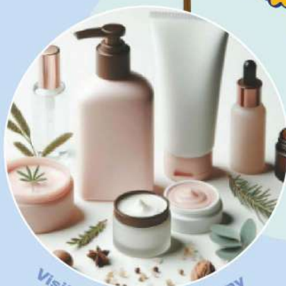
Visit to Korean Company